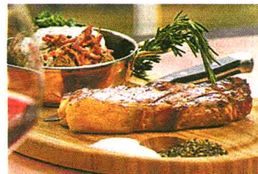
Clockwise top to bottom: Summer/Winter Steak Frite Salad of Boston Bibb and Frisee Lettuce with Vt. Cheddar, cranberries, spiced Petitas and Champagne Vinaigrette. Carrot Confit—a highlight of our meal Sabayon-Hazelnut Almond Macaroon Semi-Freddo with Chocolate Sauce Raspberry Steamed Pudding with Lemongrass